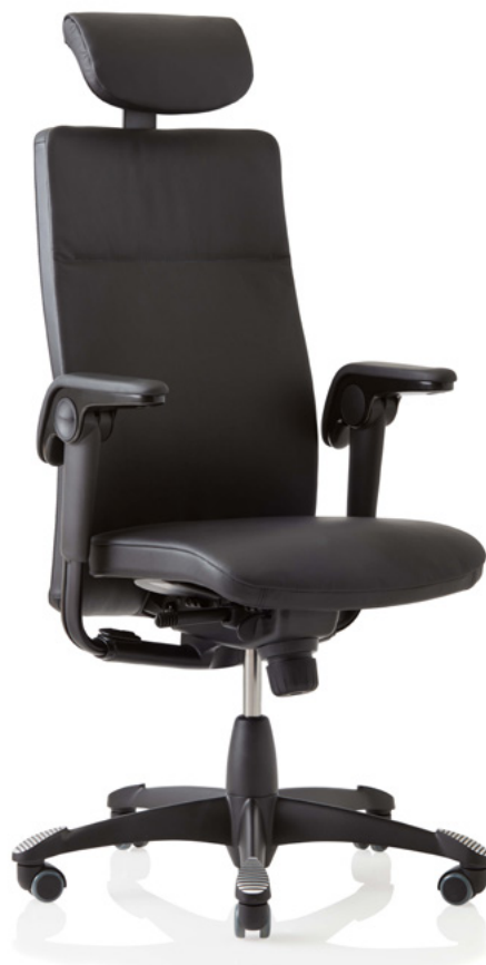
Design: Svein Asbjørnsen/sapDesign®. Patent- and design protected.